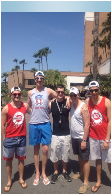
Brothers in South Padre