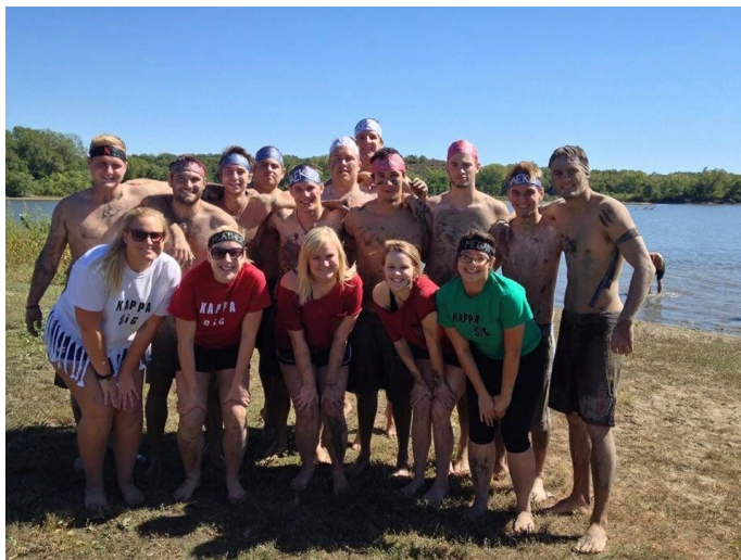
Brothers participating at the Sigma Kappa's Mud Bowl Philanthropy