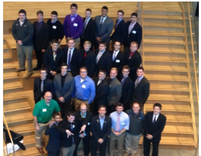
Group photo of the Brothers of Gamma-Chi after the District Grand Conclave

“be better people for ourselves and also for our esteemed fraternity”