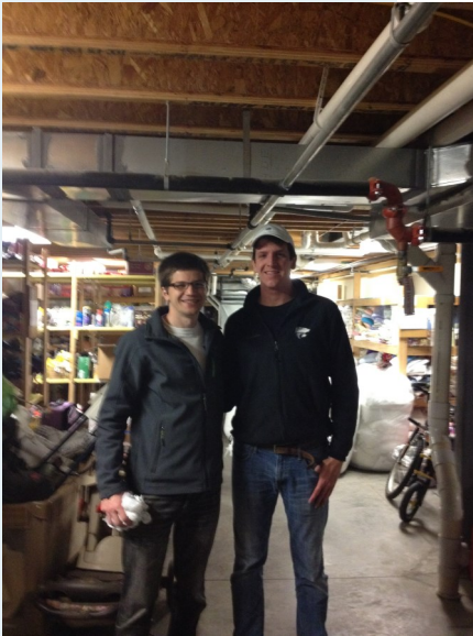
Kappa Sigma Brothers at the Manhattan Crisis Center cleaning the basement and organizing donations received .

“Gamma-Chi took the idea of giving back to the community in a great and completely unique fashion this year”