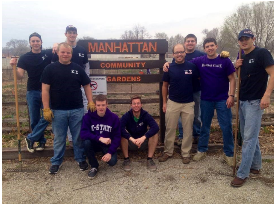
Brothers outside at the Manhattan Community Center after helping complete several hours of work in the area