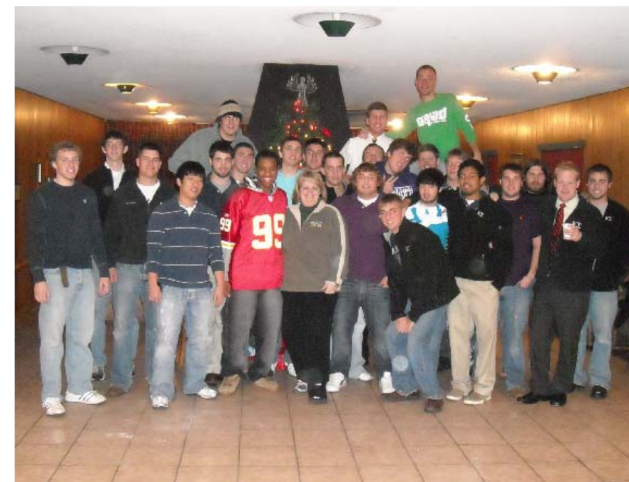
After the Chili Feed meal, the actives posed for a photo in front of the chapter house Christmas tree. Alums and actives then departed for Bramlage Coliseum for the KSU vs. Chicago St. basketball game at 6pm.