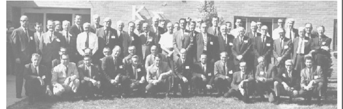
50th Anniversary Pig Dinner Reunion - 1969